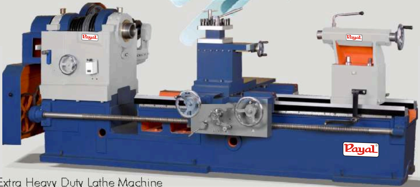
Extra Heavy Duty Lathe Machine